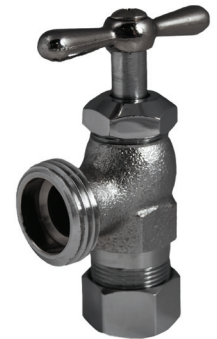
Pictured Model T-12