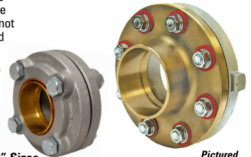
Pictured 4" Size