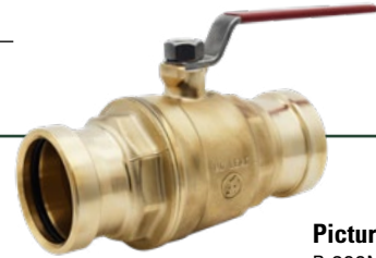
Pictured: P-200NL LegendPress® Large Diameter

Maximum service temp: 2 1/2 to 3" : 250° F @ 180 psi 4" : 230° F @ 180 psi