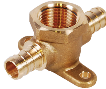
Pictured: PEX x FNPT Drop-ear tee

ANSI/ASME B1.20.1: Pipe threads, general purpose, Inch.