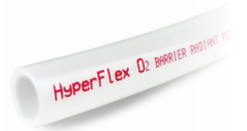
Pictured: HyperFlex Stick