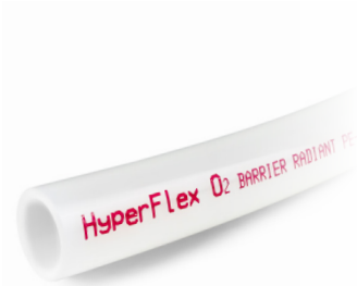
Pictured: HyperFlex Stick