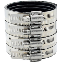
Pictured: Heavy Duty No Hub