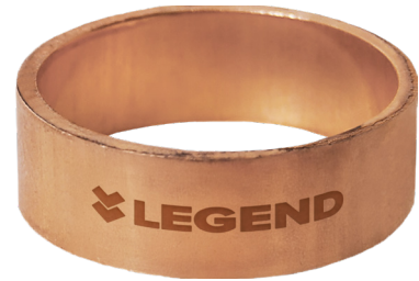
Pictured: Copper Crimp Ring