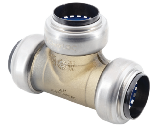
Pictured: ClearLOC Tee