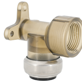
Pictured: ClearLOC Drop Ear

Available in nominal sizes 1/2", 3/4", and 1", in various configurations.