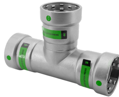
Pictured: CSW Tee

ANSI / ASME B1.20.1: Standard Specification for Pipe Threads, General Purpose (Inch)