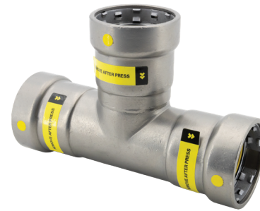
Pictured: CSG Tee

ANSI/ASME B1.20.1: Standard Specification for Pipe Threads, General Purpose (Inch)