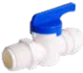
Push x MNPT Straight Ball Valve