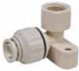
Drop Ear Elbow