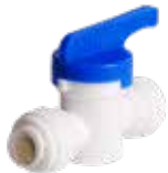
Push x Push Straight Ball Valve