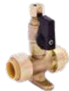
Drop Ear Tee w/ Valve