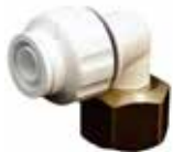
Swivel Elbow - Brass