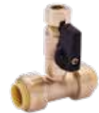
Tee w/ 3/8" OD Valve