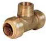
Push x MNPT Tee