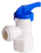
Push x FNPT Angle Ball Valve

Naturally lead free 150 psi @ 140°F & 100 psi 180°F max temp ANSI/NSF 61, NSF 14, ASSE 1061