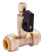
Tee w/ Valve