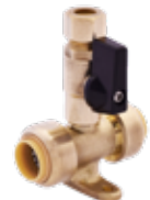
Drop Ear Tee w/ 3/8" OD Valve