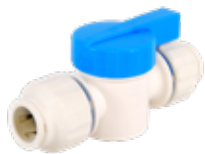
Push x Push Ball Valve

Naturally lead free Full port 100 psi @ 150°F ANSI/NSF 61, NSF 14, ASSE 1061