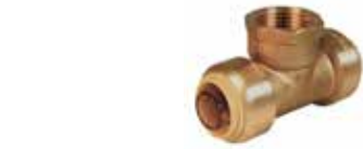
Push x FNPT Tee

200 CWP, max temp 250°F No lead/DZR forged brass ANSI/NSF 61, NSF 14, ASSE 1061