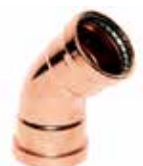
Large Press 45° Elbow