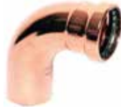
Large Press 90° Street Elbow