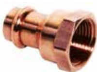
Press x FNPT Reducing

ASME B16.51 CSA Certified IAPMO Certified NSF Listed (ANSI/NSF 61)