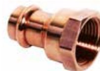
Press x FNPT Reducing

ASME B16.51 CSA Certified IAPMO Certified NSF Listed (ANSI/NSF 61)