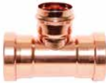
Large Press Tee

ASME B16.51 CSA Certified IAPMO Certified NSF Listed (ANSI/NSF 61)