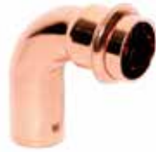
90° Street Elbow

ASME B16.51 CSA Certified IAPMO Certified NSF Listed (ANSI/NSF 61)