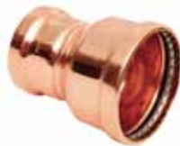
Large Press Reducing Coupling

ASME B16.51 CSA Certified IAPMO Certified NSF Listed (ANSI/NSF 61)