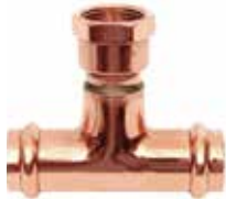
Press x FNPT Tee

ASME B16.51 CSA Certified IAPMO Certified NSF Listed (ANSI/NSF 61)