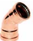
Large Press 45° Elbow