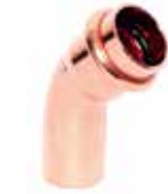
45° Street Elbow

ASME B16.51 CSA Certified IAPMO Certified NSF Listed (ANSI/NSF 61)