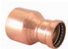
Fitting x Large Press Reducing Coupling