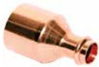
Fitting Reducing Coupling

ASME B16.51 CSA Certified IAPMO Certified NSF Listed (ANSI/NSF 61)