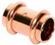
Coupling w/ Stop

ASME B16.51 CSA Certified IAPMO Certified NSF Listed (ANSI/NSF 61)