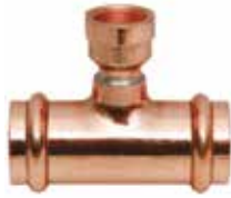
Press x FNPT Reducing Tee

ASME B16.51 CSA Certified IAPMO Certified NSF Listed (ANSI/NSF 61)