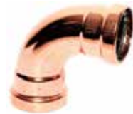
Large Press 90° Elbow