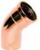
Large Press 45° Street Elbow