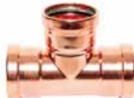
Large Press Tee