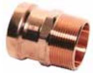
Large Press x MNPT Adapter