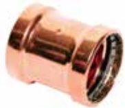
Large Press Coupling w/ Stop