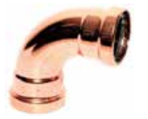
Large Press 90° Elbow