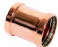
Large Press Coupling