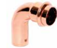
90° Street Elbow

ASME B16.51 CSA Certified IAPMO Certified NSF Listed (ANSI/NSF 61)