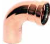
Large Press 90° Street Elbow