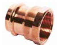
Press x FNPT

ASME B16.51 CSA Certified IAPMO Certified NSF Listed (ANSI/NSF 61)