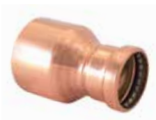
Fitting x Large Press Reducing Coupling