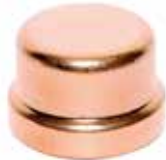
Large Press Cap