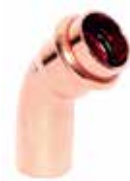
45° Street Elbow

ASME B16.51 CSA Certified IAPMO Certified NSF Listed (ANSI/NSF 61)