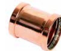
Large Press Coupling