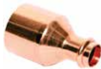
Fitting Reducing Coupling

ASME B16.51 CSA Certified IAPMO Certified NSF Listed (ANSI/NSF 61)