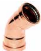
Large Press 45° Elbow