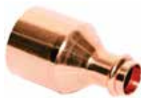
Fitting Reducing Coupling

ASME B16.51 CSA Certified IAPMO Certified NSF Listed (ANSI/NSF 61)