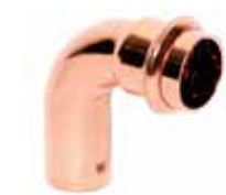
90° Street Elbow

ASME B16.51 CSA Certified IAPMO Certified NSF Listed (ANSI/NSF 61)