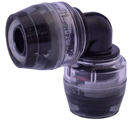
Pictured: 90° Elbow