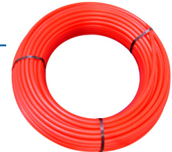
Pictured: HyperPure™ Coils