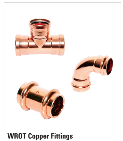
WROT Copper Fittings