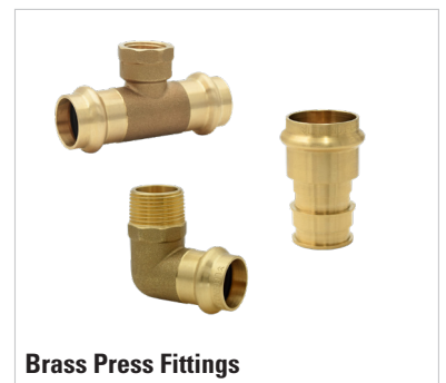
Brass Press Fittings