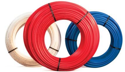
Pictured: HyperPure® Coils

Rated Pressure & Temperature 200 psi @ 73°F 100 psi @ 180°F