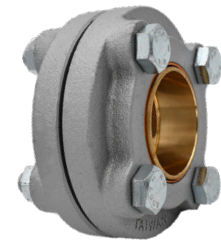
Pictured: T-571NL (2-1/2" - 3")

†Bronze sweat companion flange thickness (4" only).