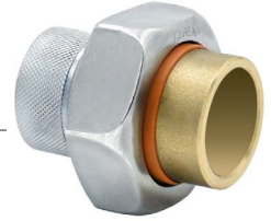
Pictured: T-571NL (1/2" - 2")

Designed to reduce galvanic corrosion where two dissimilar metals are joined. Self-aligning, non-conductive elastomer gasket and thermoplastic insert create a positive seal and complete isolation between the tubing and piping ends.