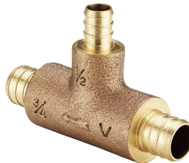
Pictured: Model T-570PNL