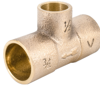
Pictured: Model T-570NL