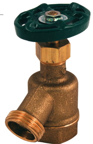
Pictured: T-543NL Bent-nose garden valve