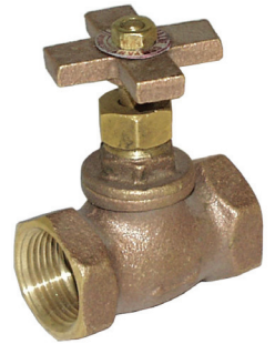
Pictured Model T-501X