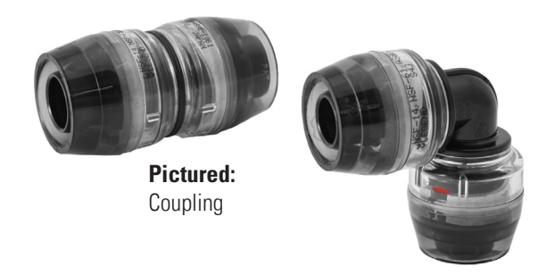
Pictured: 90° Elbow

Saturated Steam (WSP): Not suitable for steam service