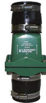
Pictured: (2") S-613