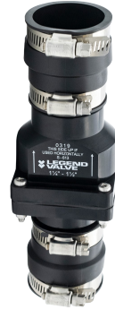
Pictured: 1 1/4" - 1 1/2" S-613