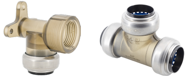
Pictured: ClearLOC Drop Ear

ANSI/ASME B1.20.1 (pipe-threaded configurations only): Pipe Threads, General Purpose (Inch)