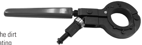
Pictured: Legend Large Diameter Crimp Tool