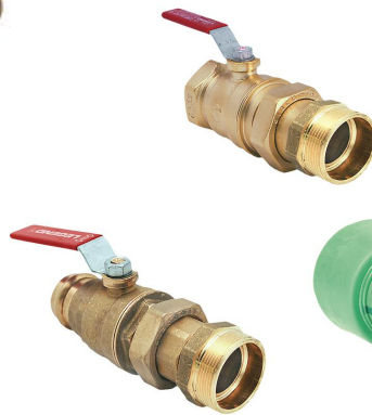
FIP – 1-1/2" 822-857

Contact Legend Customer Service for assistance in specifying and ordering accessories for the GeoGreen™ M-8400 Geothermal™ Manifold. 1-866-752-2055