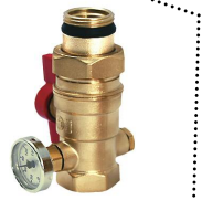
LOOP ISOLATION VALVES WITH THERMOMETERS (RED & BLUE PAIR) 1" 800-855T