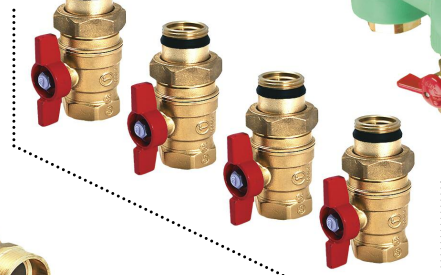
LOOP ISOLATION VALVES (RED & BLUE PAIR) 1" 800-855